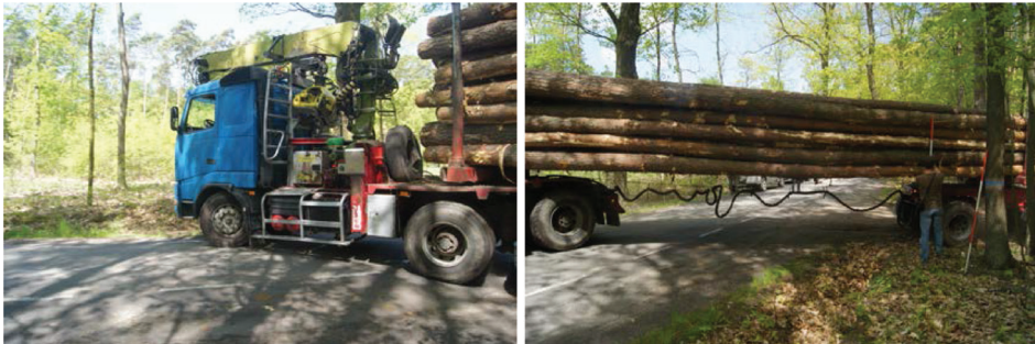
Figure 3. Testing the trajectory for a combination composed of a truck and a semi-trailer