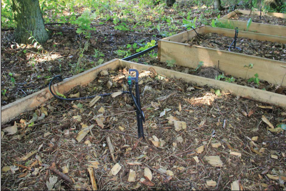
Photo 1. Microplot irrigated with micro sprinklers located in the belt of trees in the nursery in Białe Błota – variant Ec

days using Tullgren funnels. Then, the mites were preserved in 70% ethanol. All the mites were classified into orders and oribatid mites into species or genera, with regard to juvenile stages. A total of 1417 mites were determined, including 539 oribatid mites.