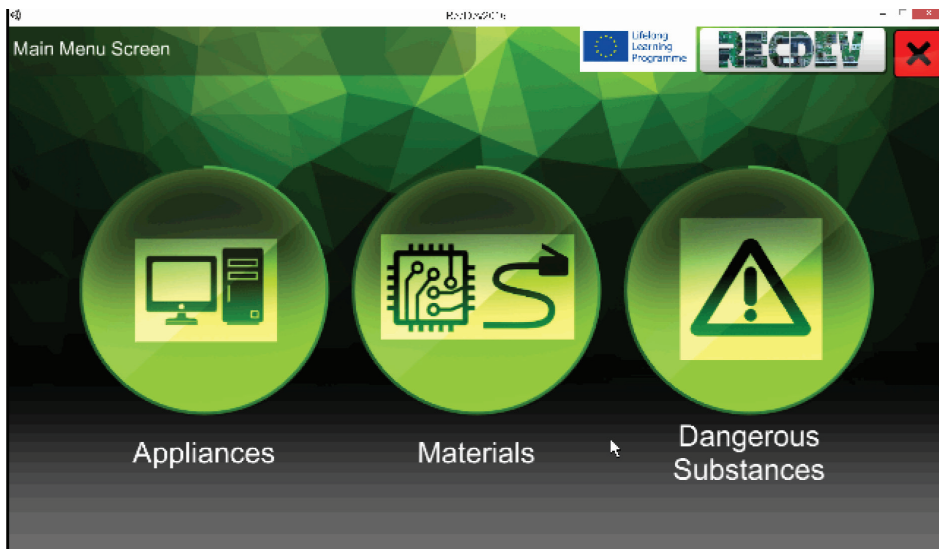
Figure 1. Main menu of 3D Tool