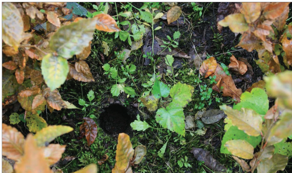
Photo 2. Interrows of 2-year-old common beech tree cultivation mulched with ectohumus

were converted into logarithms – \ln(x+1) (Berthet and Gerard 1965). Statistical calculations were done with the Statistica 10 software by means of a two-way ANOVA analysis of variance. The significance of differences was verified by Tukey's HSD post hoc test.