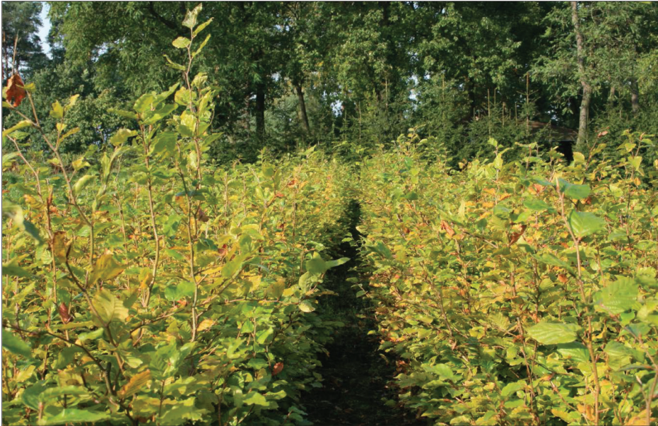
Photo 1. Seedlings of common beech in the third year of cultivation in a forest nursery

Plant growth. The growth of the beech seedlings was determined in late October. The height of the plants (cm) and the diameter of the root neck (mm) were determined. Moreover, the average number of leaves per plant and the average leaf area (cm 2 ) were determined. The results were analysed statistically with the Fisher-Snedecor test in order to establish the significance of the experimental factors, and with the Tukey test to compare the differences.