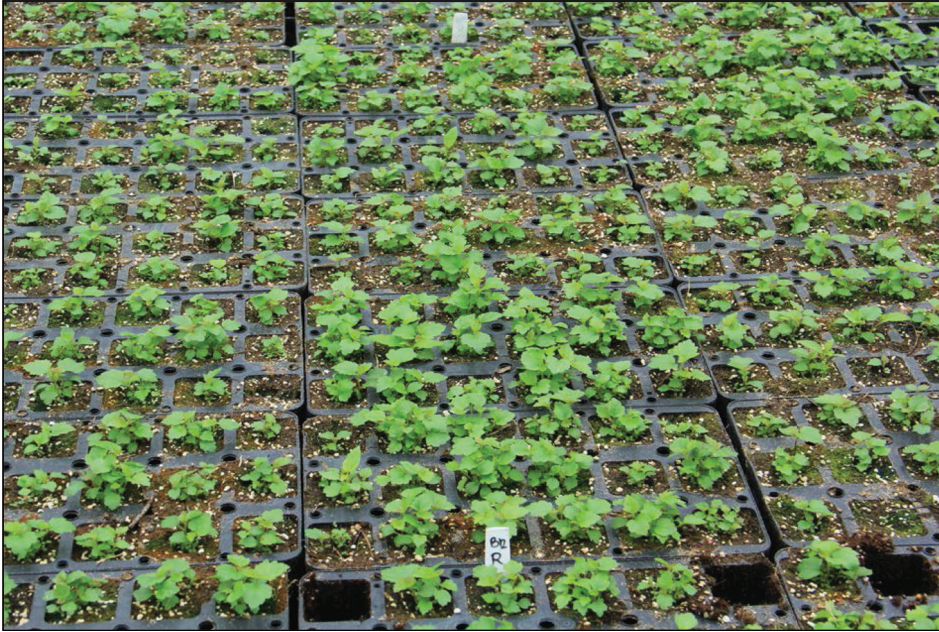
Photo 1. Containers with white birch seedlings at the external field