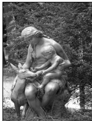
Photo 4. Small architecture – park sculpture