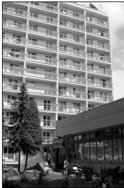
Photo 5. The “Gwarek” Locomotor System Rehabilitation Sanatorium and Hospital Complex by the central walking alley as the spa's urban dominant

Most of the spa architecture dates back to the 19 th century. The large “Gwarek” sanatorium has been built in the 1970s (currently the “Gwarek” Locomotor System Rehabilitation Sanatorium and Hospital Complex – modernised and undergoing remodelling). It remains autonomous to the existing architecture and its distribution and number of storeys make it an urban dominant.