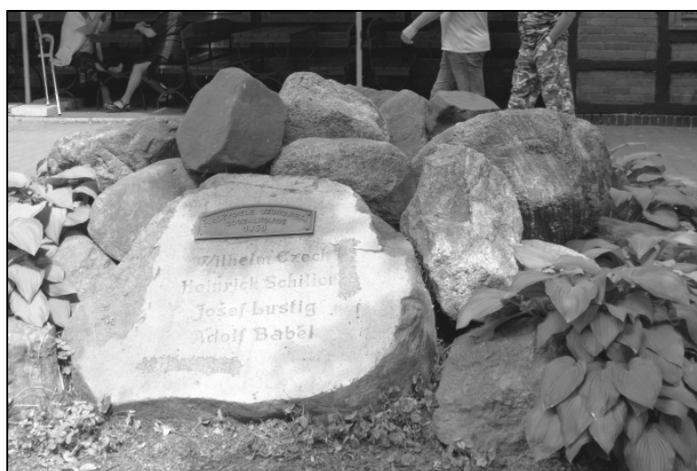
Photo 1. The memorial stone near the central walking alley dedicated to the founders of the spa