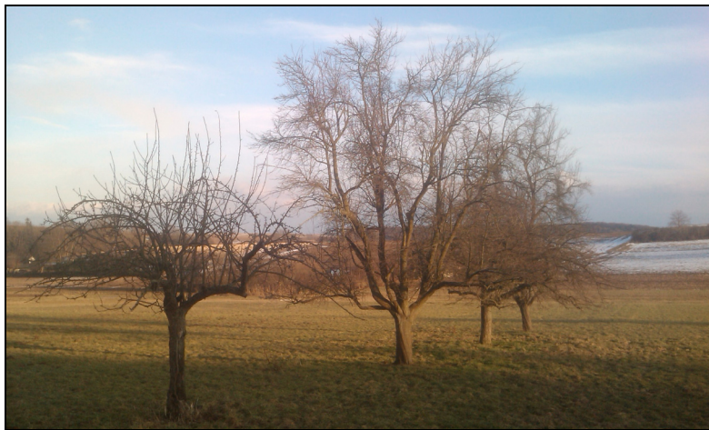
Photo 2. Non-pruned fruit trees in Hessen

will be a part of social events. Such an event could be for example harvesting fruits in autumn and the selfproduction of natural juice or fruit brandy. This is often combined with a local festival, like thanksgiving, and also offered to visitors from city regions. In that manner the problem of the lacking economic benefit is transformed into a social benefit. Therefore, it is necessary that the historical land use is legally protected and that the development of a network of people interested in using such areas is initialized.