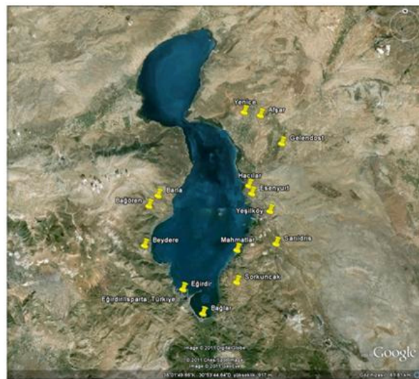
Figure 1. The coastal view of cattle breeding enterprises around the Beyşehir Lake