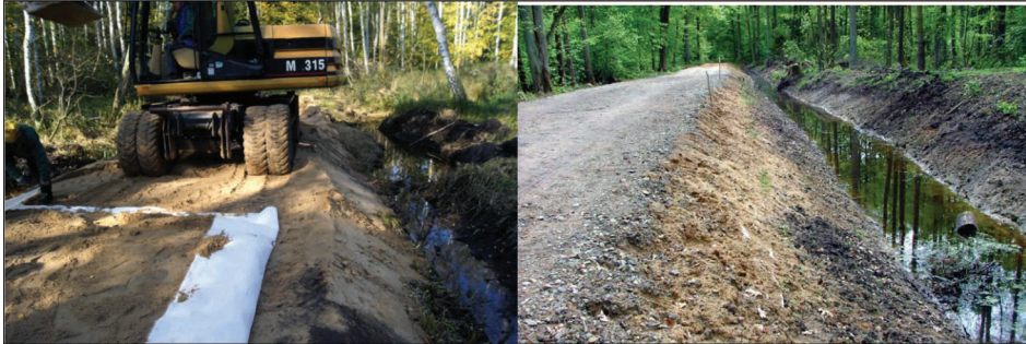
Photo 1. Construction of the experimental stretch of road and a view of the experimental stretch on the day of measurement.

characterized by a very high groundwater level, temporarily appearing also on the surface, whereas the road surface was strongly hydrated subsoil partly covered by swampy vegetation.