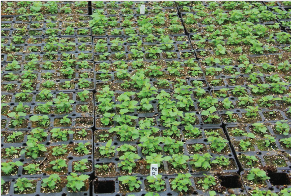
Photo 1. Containers with white birch seedlings at the external field