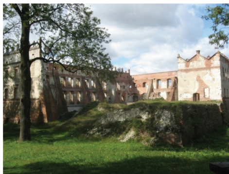
Photo 1. View of Krupce castle from the north-east