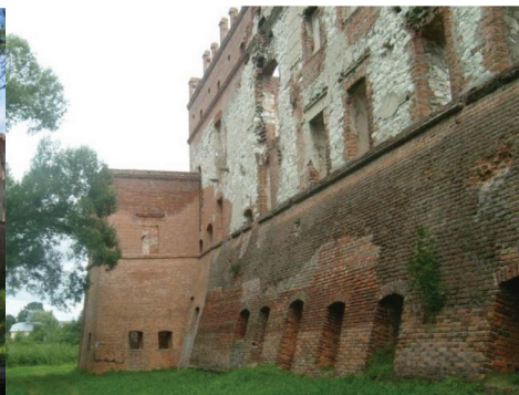
Photo 2. View of the ruins from the south (Author M. Jusiak, 2013)