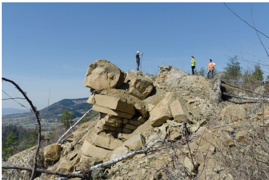
Figure 2. The inter-landslide uplifts (author: A. Wróbel).

The vertical span, that is the difference between the minimum and maximum height of the landslide is 184 m. The gradient of the landslide slope is 18^\circ , whereas the azimuth of the descent direction is 185^\circ . The height of the main slope is about 5 m, and its gradient measures about 50^\circ . The length of the colluvium is respectively shorter than the length of the landslide that includes the area of the main slope. The meridional span of the area covered by the landslide material is 1030 m with the average gradient of about 12^\circ . The height of the head of the landslide is slightly shorter than that of the main slope and measures 3 m. The thickness of the colluvium is estimated to measure about 30 m (Drwal et al., 2013).