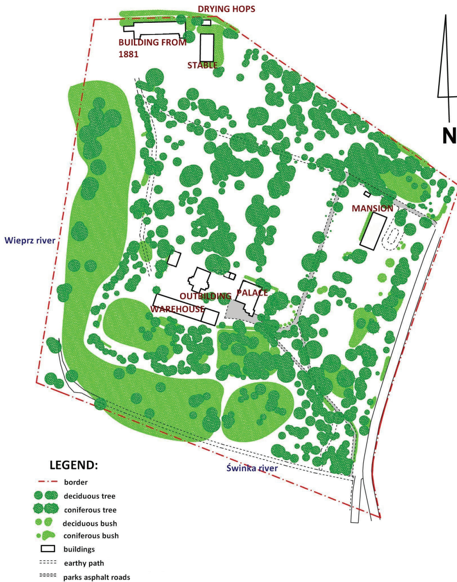
Figure 1. The post manor park in Łęczna – dendrological inventory in 2011 (M. Dudkiewicz)