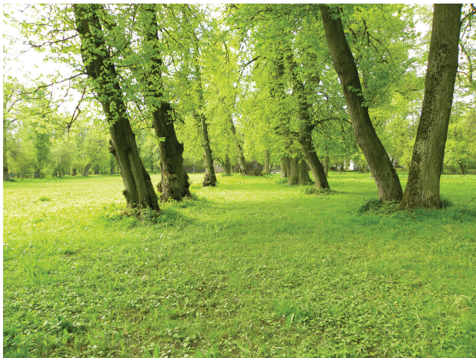
Photo 1. A fragment of the composition of the eighteenth's century park (M. Dudkiewicz)

the palaces, most of which were built on the hills, on the sunlit side. The location was advantageous for health (place on a hill – airy and sunny), favorable to farm management (proximity to water and easy communication), and emphasized the prestige of the owner (the view of the city Łęczna). The property was a vantage point and dominated over the city. It was located in a strategic position in terms of defense and it was the most beautiful one as well. The park still has a very good exposure in the landscape. It smoothly changes into the Wieprz valley landscape. The park is closely related to the panorama of the city viewed from the side of Lublin.